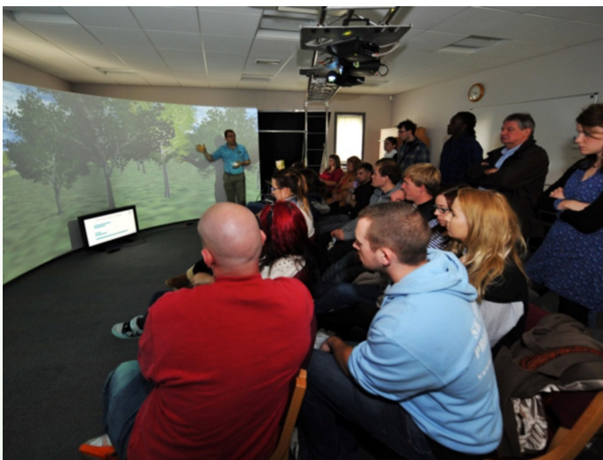
Visualisation representing trees in an urban environment with audience participation.